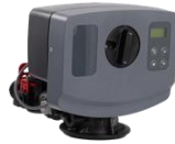
Control valve BNT 1650